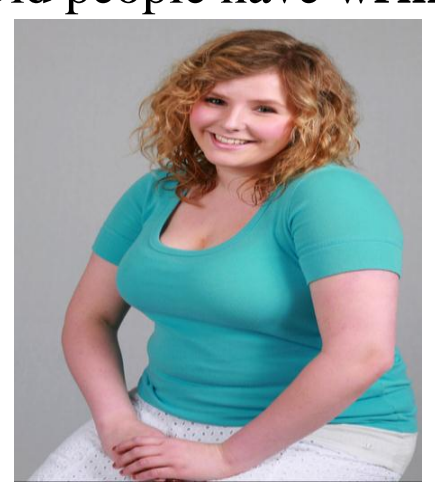
The woman is plump .