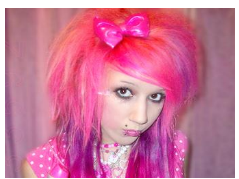
She dyed her hair pink.