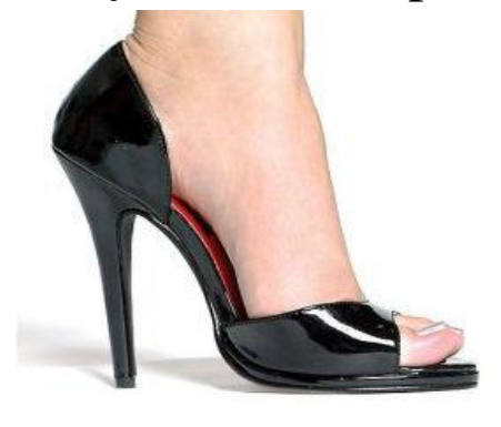
She always wears high heels.