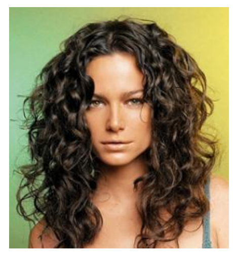
She has curly hair.