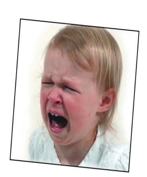
He is a naughty child. He behaves badly.